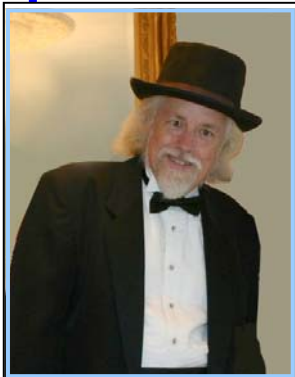
The Victorian Gentleman