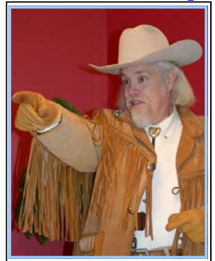
Buffalo Bill Cody

Your students are the real stars of our original interactive murder mystery show. They assume the characters of actual people from 1897 attending a banquet given by the Faulkners to celebrate the opening of their new mansion. There are no lines to remember, so they're free to ad lib as much or as little as they like ... and they can be counted on to come up with some pretty hilarious dialogue. When a dastardly murder mars the celebration, audience members