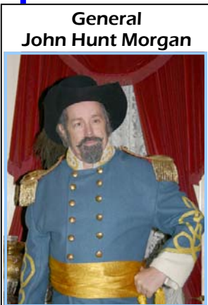
General John Hunt Morgan